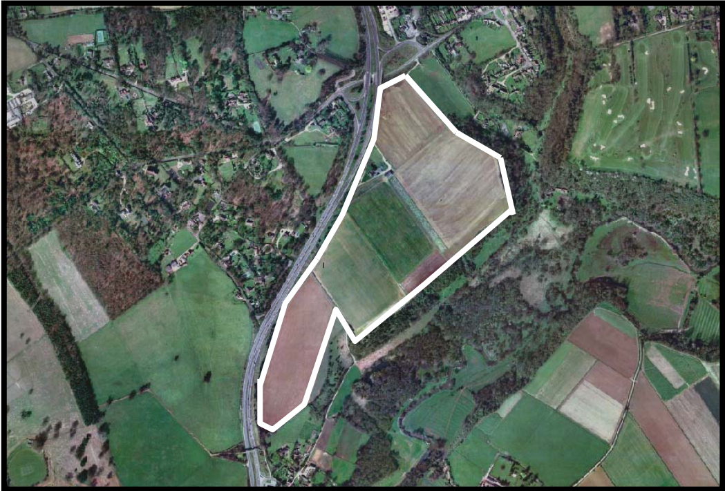
Figure 21 PMZ71 Eashing Farm